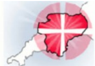
Plymouth & Exeter Methodist District

This is an important contribution to the work of the District as a whole. It is a voluntary role which will involve some travel. Travel Expenses will be reimbursed.